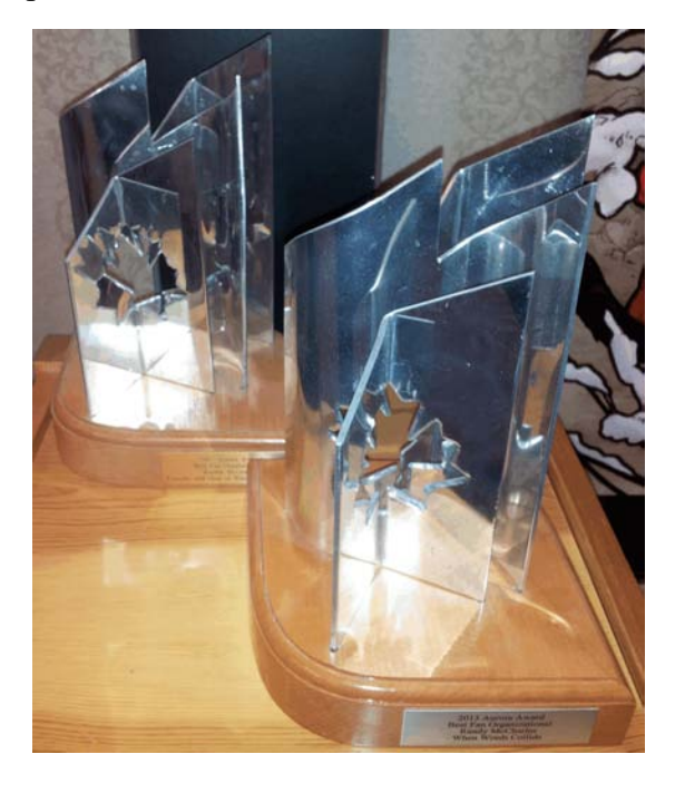
At right is a display showing three Aurora awards. A closeup of two of them are at left.